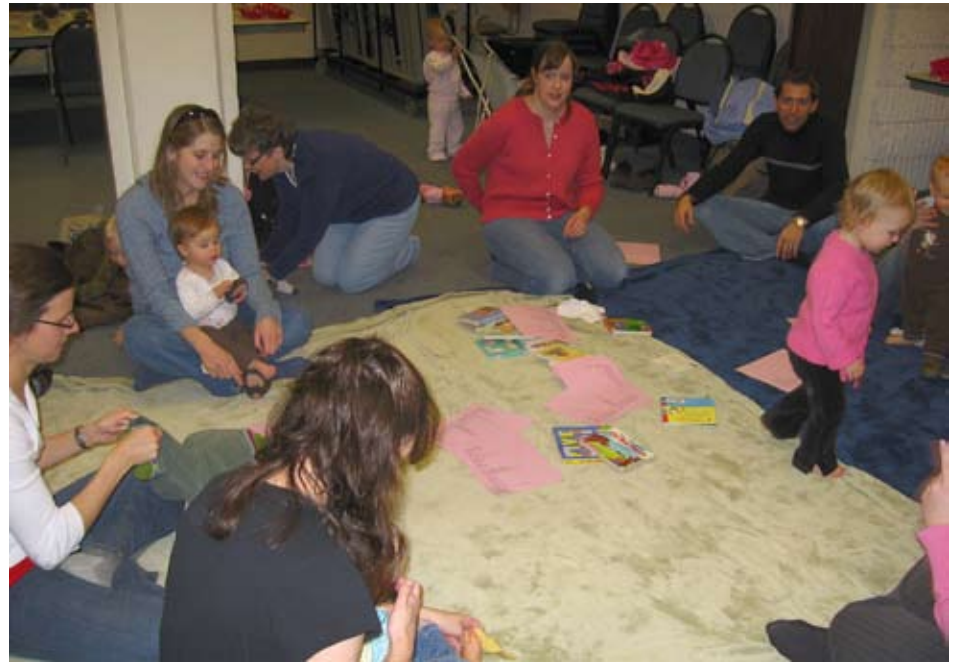
Babies and their parents participate in Babies Bounce into Books program at the Main Library in Kalispell.

"By working together, with support from the governor's office and the legislature, we are able to provide Montanans with unprecedented access